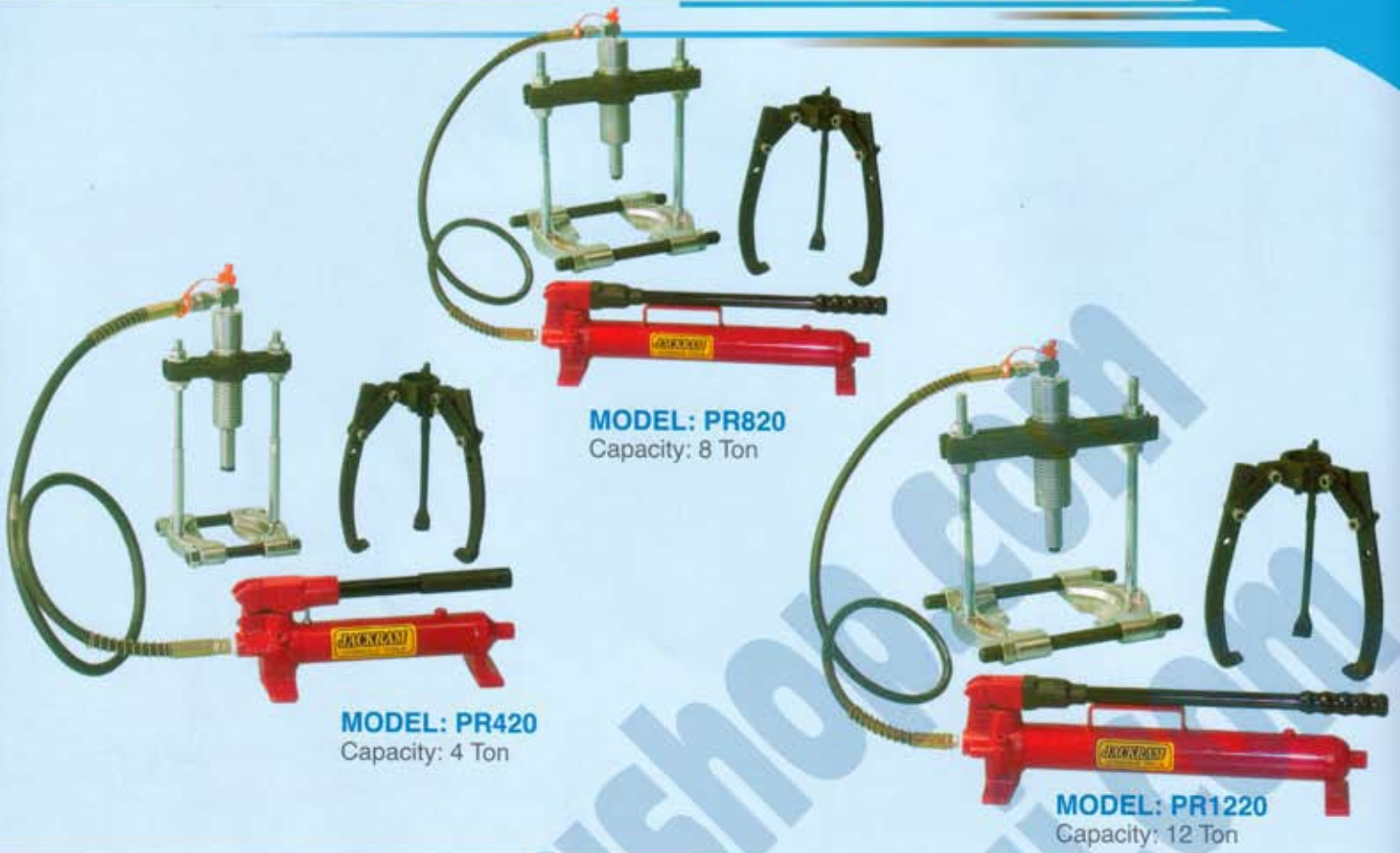
MODEL: PR820 Capacity: 8 Ton