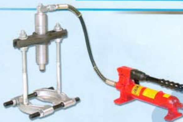
MODEL: PR810 Capacity: 8 Ton