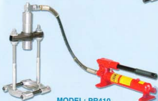
MODEL: PR410 Capacity: 4 Ton