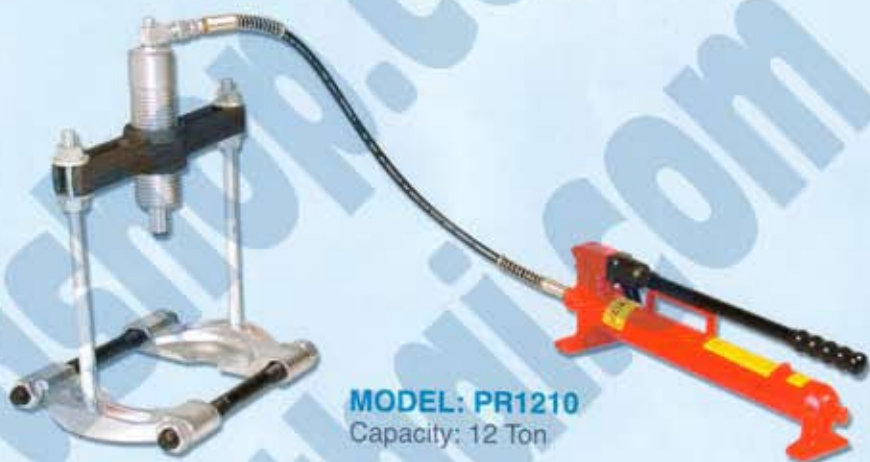
MODEL: PR1210 Capacity: 12 Ton