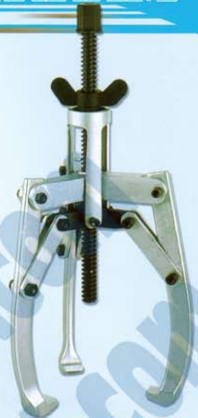
MODEL: PM150 Capacity: 10 Ton