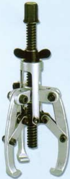
MODEL: PM50 Capacity: 2 Ton