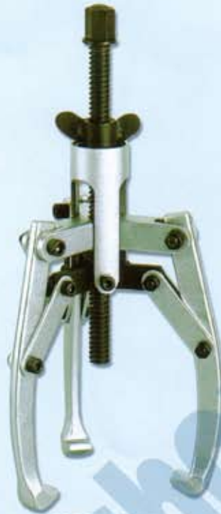
MODEL: PM100 Capacity: 5 Ton